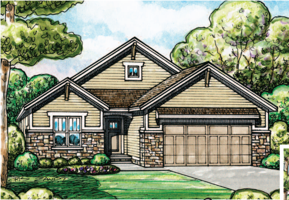
Home plans and elevations may change without notice.